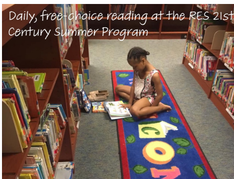
Daily, free-choice reading at the RES 21st Century Summer Program